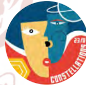
Constellations [Queer Edition]